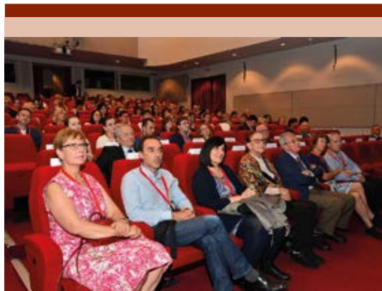
Figure 2. The auditorium of the conference in the National House, Slovak Chamber Theatre.